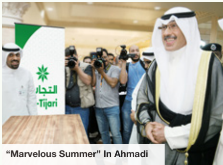
"Marvelous Summer" In Ahmadi

The Bank continued its efforts & cooperation with Al Ahmadi Governorate by offering sponsorship & support to the social activities and events organized by the Governorate. In this context, the Bank sponsored "Umm Al-Khair" Festival on the occasion of the Governorate's celebrations of the national days. The festival witnessed enjoyable shows by music bands and a number of entertainment & awareness activities and contests. At another front, the Bank sponsored the first Summer Entertainment Festival entitled "Marvelous Summer in Ahmadi" which was organized by Ahmadi Governorate with participation of a number of public, private and voluntary entities. Furthermore, the Bank offered sponsorship to the 3 rd Co-Op Indoor Football Championship which lasted for 3 days. The Bank's sponsorship of this championship came within its continued efforts towards society servicing and to reflect its endeavors to participate in all societal activities & events, including sporting activities, organized by Kuwait Governorates and Civil Society Institutions. In addition, the Bank supported the 3 rd Awareness Forum for Rationalization of Electricity & Water Consumption organized by Ahmadi Governorate in collaboration with the Ministry of Electricity & Water. The Bank endeavors to participate in such awareness campaigns targeting all society segments and which are positively reflected on Kuwaiti citizens.