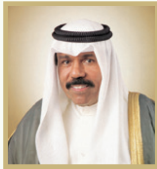
His Highness Sheikh Nawaf Al-Ahmad Al-Jaber Al-Sabah The Crown Prince of The State of Kuwait