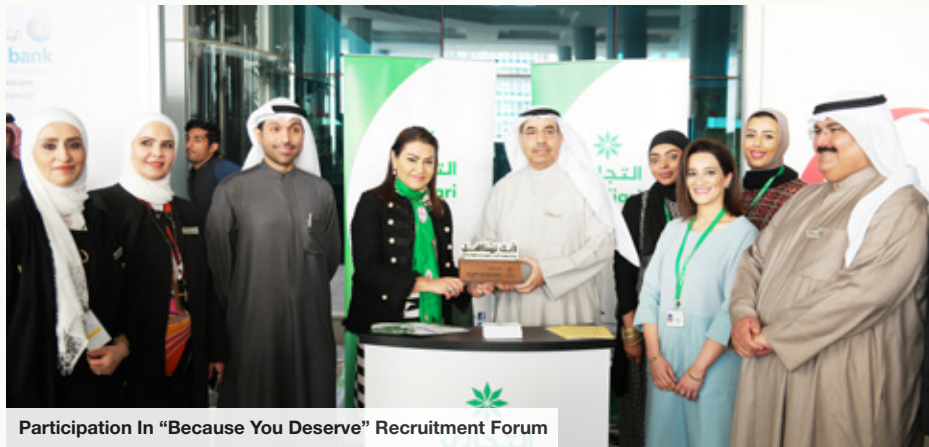
Participation In “Because You Deserve” Recruitment Forum