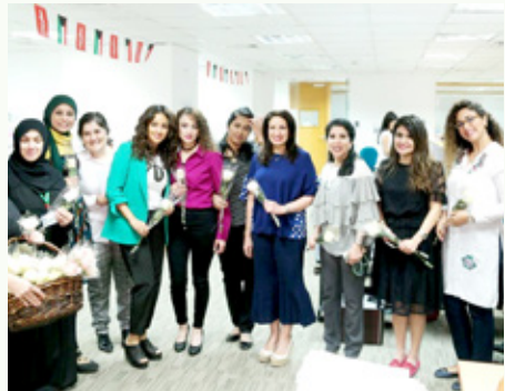
Distributing Flowers To The Employees On Mother's Day