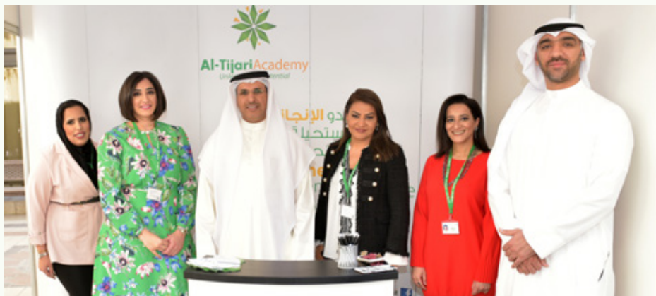
Al-Tijari's Participation In The “Economy Makers & Employment Opportunities Exhibition”

Accentuating its continued efforts in supporting education activities in Kuwait and out of its social responsibility as a leading financial institution which endeavors to support Kuwaiti youth seeking distinct employment opportunities in the banking sector, the Bank participated in the 23 rd «Economy Makers & Employment Opportunities Exhibition» organized by the College of Business Administration – Kuwait University. The Bank also participated in “Because You Deserve” Recruitment Forum organized by the Manpower and Government Restructuring Program. The Bank’s participation in such events came to confirm its endeavors to support the Kuwaiti young people seeking distinct job opportunities and attract the fresh graduates wishing to be employed with the banking sector to achieve their ambitions in this career. It is known that the Bank places high importance for enhancing the capabilities of youth for creativity and success by supporting this significant segment and communicating with them. Within its cooperation with all institutions in Kuwait and its endeavors to assume its social