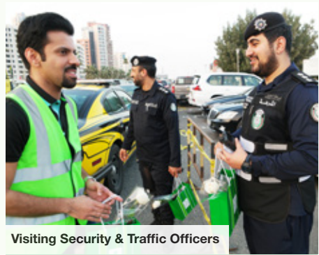
Visiting Security & Traffic Officers