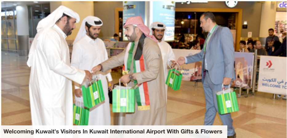
Welcoming Kuwait's Visitors In Kuwait International Airport With Gifts & Flowers