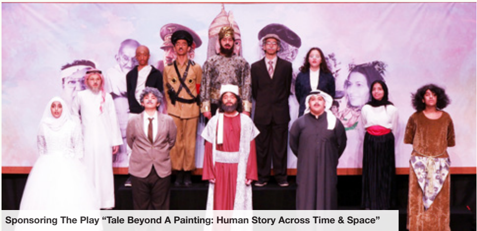
Sponsoring The Play "Tale Beyond A Painting: Human Story Across Time & Space"