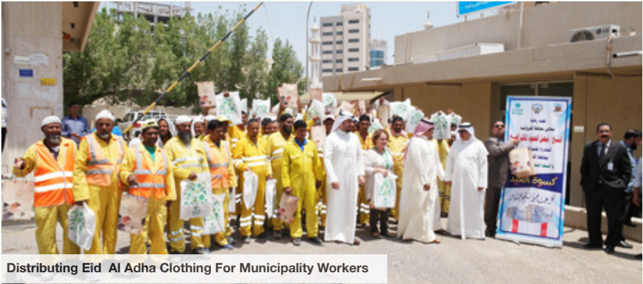
Distributing Eid Al Adha Clothing For Municipality Workers