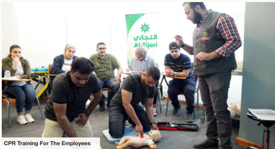
CPR Training For The Employees