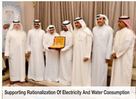
Supporting Rationalization Of Electricity And Water Consumption