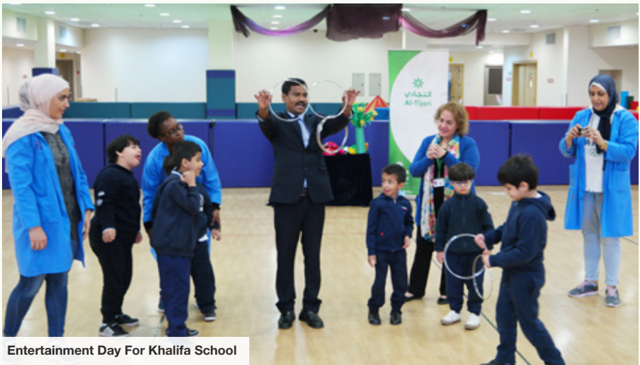
Entertainment Day For Khalifa School