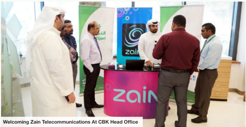
Welcoming Zain Telecommunications At CBK Head Office