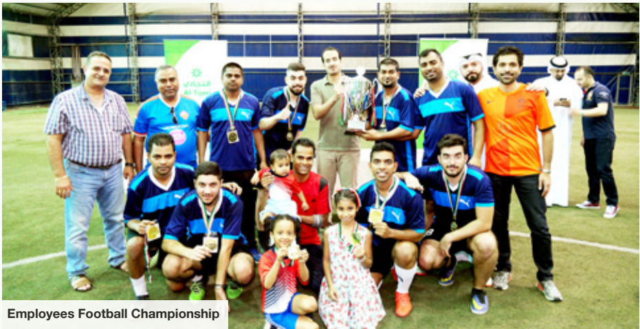
Employees Football Championship