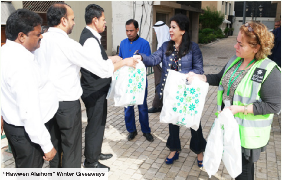
“Hawwen Alaihom” Winter Giveaways

The activities of «Hawwen Alaihom» Campaign continued for the seventh year in row. Corporate Communications Team distributed winter and summer clothes to the road cleaners and construction workers in their work locations in addition to the commemorative gifts distributed to them during Kuwait national days including Kuwait flags in addition to some t-shirts and caps bearing Kuwait flag and some other gifts. With the Advent of the Holy Month of Ramadan and for the third consecutive year, the Bank launched its campaign «Your Pre-Dawn Meal from the Bank / Suhoorkom Alina» by distributing pre-dawn meals «suhoor» to road cleaners and construction workers in their work locations. The Bank also celebrated Eid Al-Fitr and Eid Al-Adha with the road cleaners and construction workers by distributing Eid new clothes to them on such happy occasions.