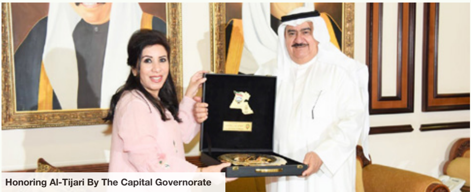
Honoring Al-Tijari By The Capital Governorate

In another context, the Bank also offered support for the activities organized by the Capital Governorate by sponsoring the closing ceremony that marked the activities & programs related to the Technical Guidance of the Scout Activities - Capital Educational Department. This sponsorship came within the Bank's social responsibility program which aims at supporting all educational, social and youth activities organized by Kuwait governorates.