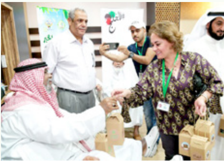
Gergeaan Giveaways At Farah Specialized Center