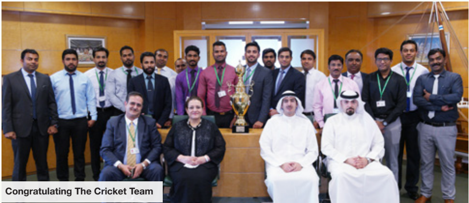
Congratulating The Cricket Team

At another front, the Bank organized a football tournament for its staff members and their relatives who participated in this sporting event. The matches saw impressive attendance by the employees and their relatives amidst enjoyable family gathering. At the end of the tournament, the Bank's Chairman honored the team that was ranked first in the tournament. Moreover, the Bank sponsored Golf championship organized by Sahara Resort and which saw strong competition and enthusiasm among the players. This sponsorship came to reflect the Bank's belief in the importance of supporting the diverse sporting activities in which several segments of society participate.