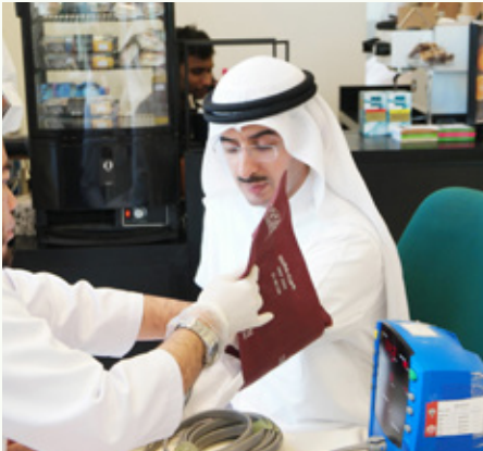
Chairman's Participation In The Blood Donation Drive

Within the humanitarian activities that truly reflect the voluntary social work, the Bank organized a blood donation campaign for its staff member. The blood donation campaign saw impressive participation from all staff members who opted to participate in such humanitarian activity. In this regard, Corporate Communications Division e-mailed awareness tips to all staff members for participation in this campaign and which considerably contributed in raising staff members' awareness about blood donation and enriched their knowledge with the benefits of blood donation for both donor and donee. The organization of this campaign came to reflect the spirit of solidarity and cooperation between the Bank staff members and the different medical institutions including the Blood Bank.