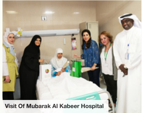
Visit Of Mubarak Al Kabeer Hospital