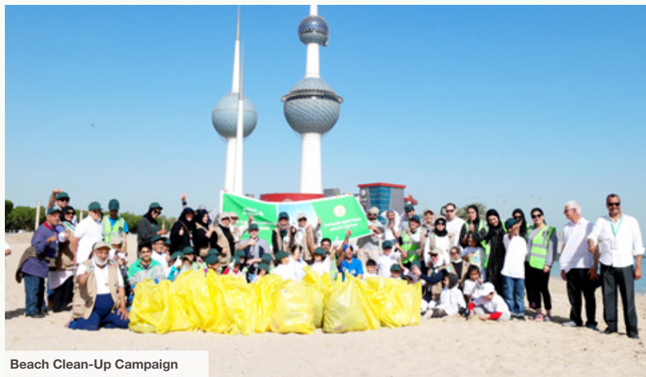
Beach Clean-Up Campaign