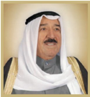
His Highness Sheikh Sabah Al-Ahmad Al-Jaber Al-Sabah The Amir of The State of Kuwait