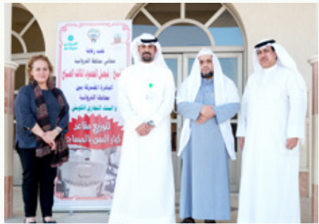
Providing Chairs For Mosques Within Farwaniya Governorate