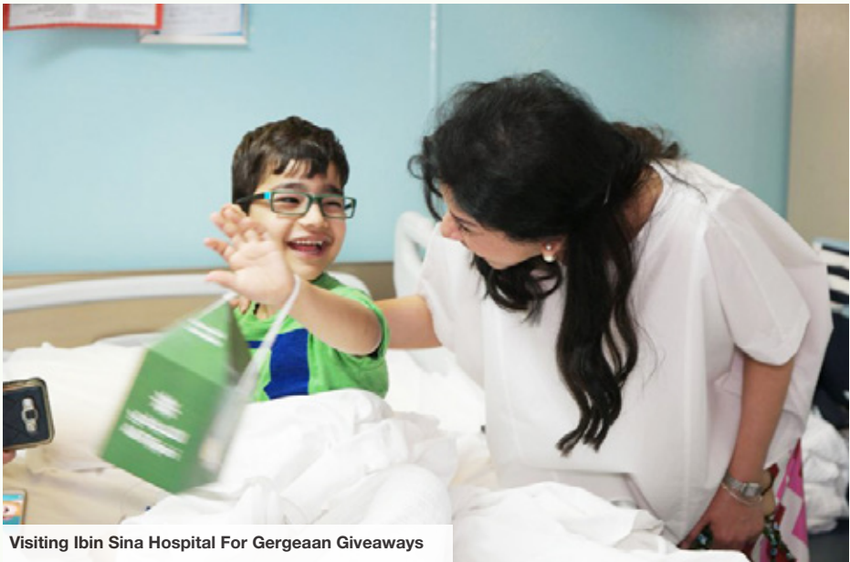
Visiting Ibin Sina Hospital For Gergeaan Giveaways