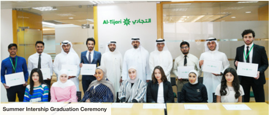
Summer Internship Graduation Ceremony

The Bank celebrated the graduation of a new group of its employees who successfully completed the Institute of Banking Studies' professional programs accredited by Institute of Financial Studies, Britain. The Bank's employees obtained certificates in a number of professional programs, namely accredited certificates on Certified Credit Management (CCM), Advanced Certificate in Credit Management (ACCM), Certified Bank Branch Manager (CBBM) and Certified Assistant Bank Branch Manager (CABBM). The graduation ceremony was held in presence of the Bank's Executive Management Team and a number of the Bankers from banking sector. The Bank also celebrated the graduation of a number of new groups of its staff members after they have successfully completed their training in "Al-Tijari Academy" in the area of Virtual Banking and Contact Center. It is known that the Bank places high importance for training its employees, providing them the opportunity to learn the required skills that support their career path, developing their knowledge, reinforcing their