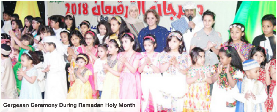
Gergeaan Ceremony During Ramadan Holy Month

Within its continued efforts towards society servicing and its support of the social activities & events, the Bank, in cooperation with Mubarak Al Kabeer Governorate, provided computers to the “Elderly Club” located in Mubarak Al Kabeer Governorate. Furthermore, and within its endeavors to accentuate its social responsibility efforts, the Bank patronized the Gergeaan ceremony to communicate with all the Governorate's inhabitants during the Holy Month of Ramadan.