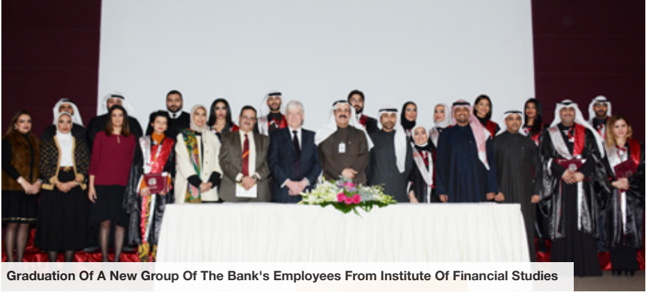
Graduation Of A New Group Of The Bank's Employees From Institute Of Financial Studies