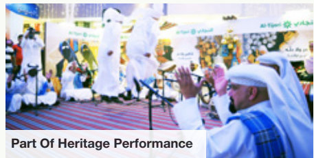
Part Of Heritage Performance