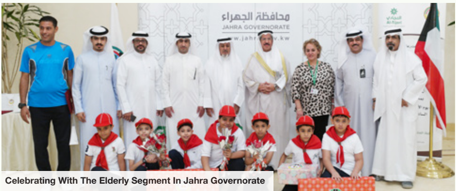
Celebrating With The Elderly Segment In Jahra Governorate

Within its cooperation with Jahra Governorate and out of its belief in the importance of supporting and sponsoring the educational & cultural activities & events organized by schools in Kuwait and enhancing the important role of teachers in educating the Kuwaiti students, the Bank patronized the honoring party of orchestra music band for the male and female teachers at the schools supervised by Jahra Educational Department. In another context, the Bank participated in the honoring party of the Elderly on the occasion of the International Day of the Older Persons. This participation was meant to raise awareness of Kuwait society and the youth segment on the importance of rendering services and assistance to the elderly segment along with ensuring respect to them.