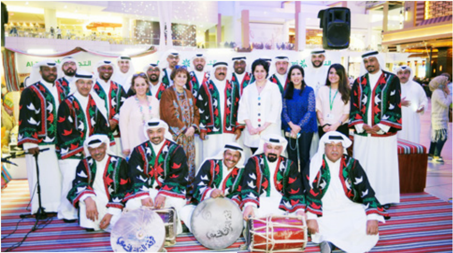
"Ya Zeen Turathna" Campaign In The Avenues Mall