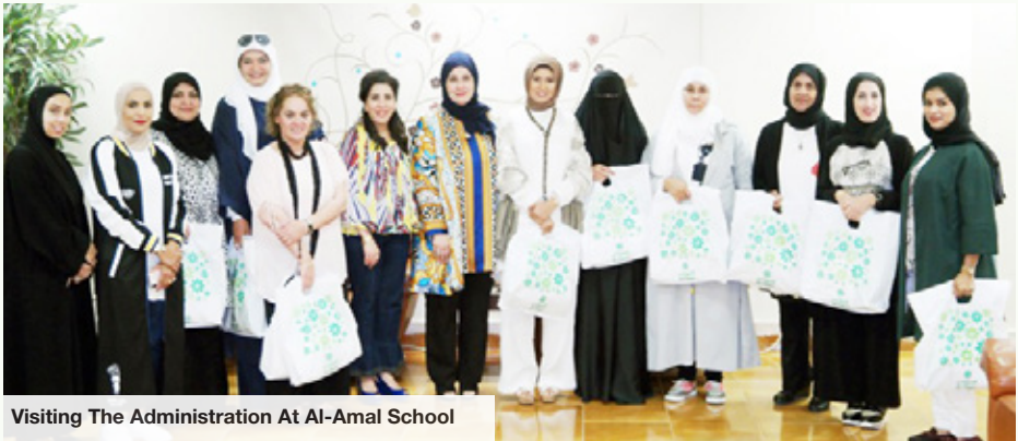
Visiting The Administration At Al-Amal School

School, Al-Noor School and Al-Atta Nursery. The visit aimed at congratulating the teaching staff on the beginning of the new school year by distributing giveaways to both the Administration and the teaching staff. This visit came out of the Bank's belief in the main role of special education teachers in educating, supporting and providing assistance to the children with special needs, this segment which deserves all care and attention. Furthermore, and within the Bank's comprehensive social responsibility programs aiming to provide support and assistance to all society segments, Corporate Communications Division organized an entertainment day for Khalifa Special Needs School's children. The organization of this day coincided with the International Day of Persons with Disabilities. The entertainment Day saw several fun activities such as the Magic Show which drew smile on the faces of children who enjoyed the activities of such event that brought happiness to their hearts and contributed in raising their morale.