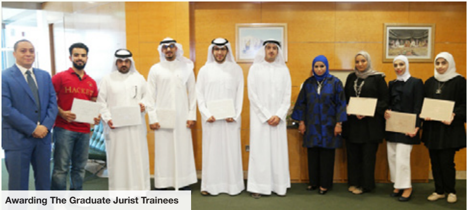
Awarding The Graduate Jurist Trainees

The Bank also offered exclusive sponsorship to "Tale Beyond a Painting: Human Story Across Time & Space" Play which was held on Dasman Bilingual School's theater under patronage of His Highness the Minister of Education and the Minister of Higher Education and in the presence of a number of official, culture and art figures and a group of the Bank's Top-Executives.