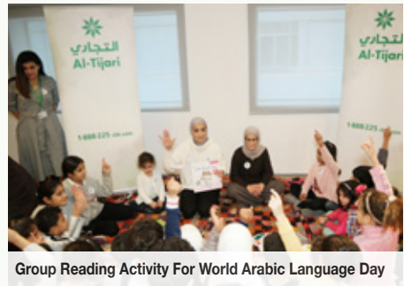
Group Reading Activity For World Arabic Language Day