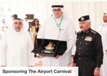
Sponsoring The Airport Carnival