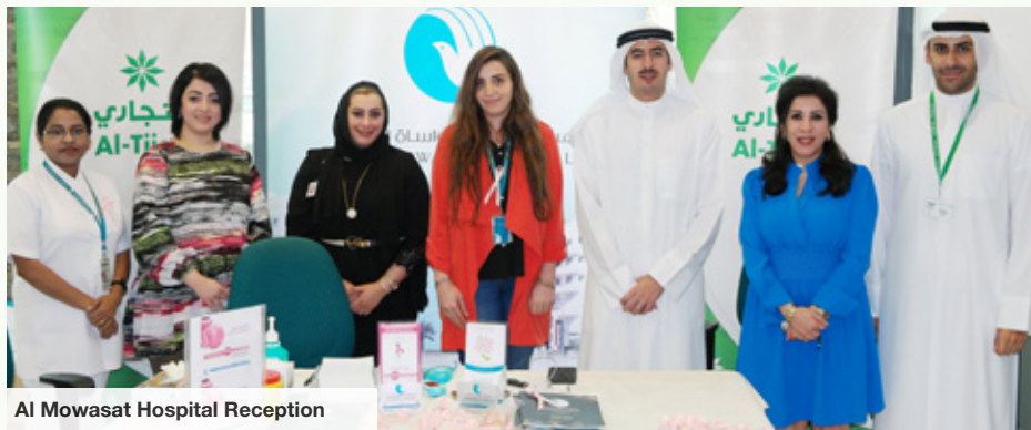
Al Mowasat Hospital Reception

The Bank always endeavors to provide its staff members with all means of healthcare. Drawing on this, Corporate Communications Division received New Mowasat Hospital Medical Team at the Bank Head office and its premises in Beirut Street for two days to provide checkup to the Bank staff members and give staff members the medical advices and consultations on blood pressure and blood sugar. In another context, the Bank enrolled a number of its staff members from the Head Office, branches and its premises located in Hawalli under the Heart Disease Awareness Campaign "Help" which aims at training the participants on CPR (Cardio Pulmonary Resuscitation) skills. The campaign was arranged by Kuwait Heart Foundation in cooperation with Life Sciences Academy. Within its constant awareness efforts to get its female staff members aware of cancer fighting tips and in concurrence with October; the Breast Cancer Awareness Month which takes pink ribbons as its international symbol of Breast Cancer, Corporate Communication