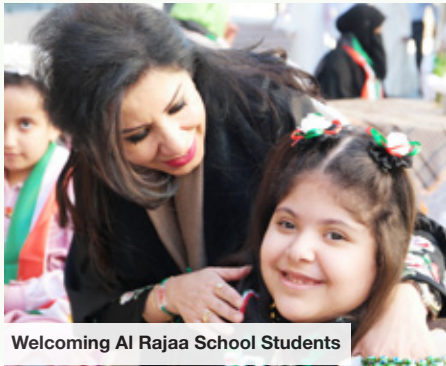
Welcoming Al Rajaa School Students

Furthermore, the Bank arranged a visit and distributed gifts to security & traffic officers who streamline traffic flow in the Arabian Gulf Street in recognition of their efforts and important role in ensuring safety and security of Kuwaitis & residents during their celebrations of Kuwait national days. This visit came within the Bank's endeavors to communicate with all society segments and as a token of appreciation of the efforts of security officers working in Ministry of Interior's diverse departments. As a new gesture aiming to share the State of Kuwait and Kuwaitis their celebration of Kuwait national days, the Bank's Corporate Communications Division Team was present in Kuwait International Airport (Arrivals) to welcome the visitors during such occasions by distributing flower bouquets & commemorative gifts to them. This gesture was highly commended by the guests who visited Kuwait to share its nationals & residents their celebrations of Kuwait national days.