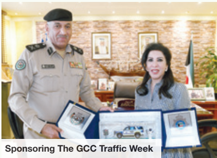
Sponsoring The GCC Traffic Week

In celebration of the World Arabic Language Day and in cooperation with Dar Al Athar Al Islamiyyah (a cultural organization based in Kuwait), the Bank sponsored "A Reading Story Event" for children under the caption "Tablets & Smart Phones Screens Everywhere". The organization of this day came to reflect the importance of reading for children in view of their growing interest in computer and smart phones screens which tended to be a sort of attraction for children rather than reading and education. Furthermore, and within its endeavors to support the awareness campaigns arranged by the Ministry of Interior, the Bank sponsored the Unified GCC Traffic Week 2018 under the caption «Your Life is Precious». This support by the Bank came to demonstrate its national drive and corporate social responsibility towards society to raise road users' awareness on the traffic law & rules.