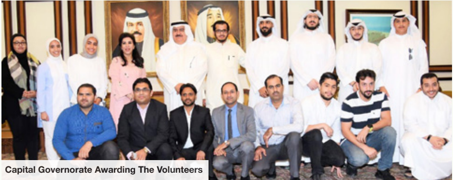
Capital Governorate Awarding The Volunteers

The Bank has had a pivotal social role during the year 2018 by offering financial contributions to the six Governorates of Kuwait to support all social, cultural, educational and sporting activities organized by Kuwait Governorates.