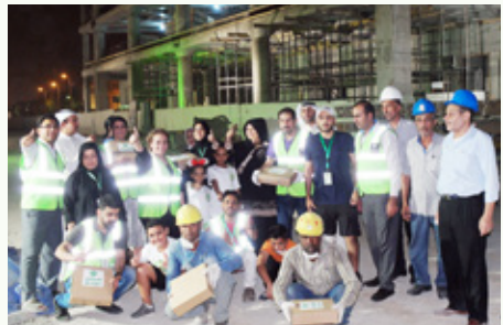
“Suhoor” Meals for Construction Workers & Cleaners