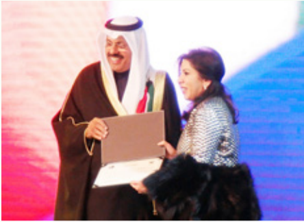
Honoring Al-Tijari By The Hawalli Governorate

Within its social program targeting all aspects of support & assistance to all society segments, the Bank supported the activities & events organized by Hawalli Governorate by distributing Iftar (fast break) meals to people during the Holy Month of Ramadan. In coincidence with Eid Al-Fitr and Eid Al-Adha, both Corporate Communications Team and Hawalli Governorate's officials participated in arranging visit to the patients residing in Mubarak Al Kabeer Hospital to congratulate the patients on such happy occasions and distributing gifts & flowers to them. Within the pre-agreed arrangements with the Governorate, the Bank in cooperation with Hawalli Governorate, contributed in providing BrailleSense Polaris device for Kuwait Blind Association to satisfy the needs of the visually impaired persons and help them in their learning and proactively interact with the community.