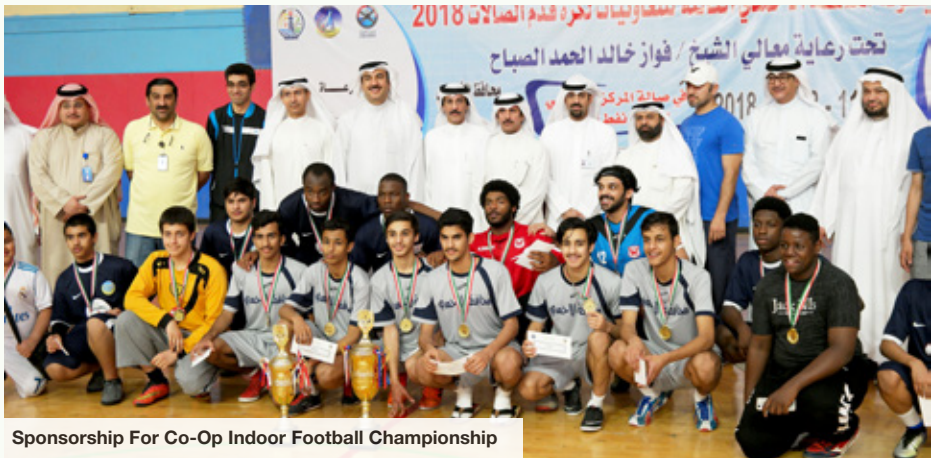
Sponsorship For Co-Op Indoor Football Championship