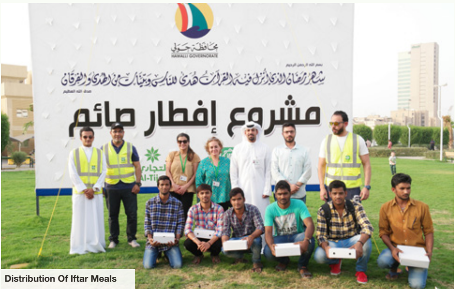
Distribution Of Iftar Meals