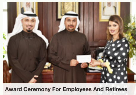
Award Ceremony For Employees And Retirees